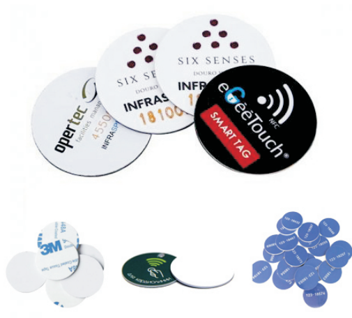
RFID coin tag with pre-printed