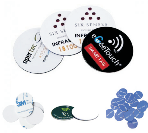
RFID coin tag with pre-printed