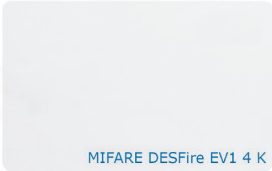
MIFARE DESFire EV1 4 K